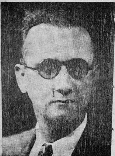
DON RAFAEL EDUARTE, Presidente Municipal y Capitán de Puerto