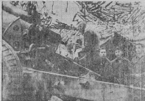
El Padre Gregory Kennedy, del ejército estadounidense, da la sagrada Comunión a un grupo de artilleros durante los sencillos servicios celebrados el Domingo de Resurrección cerca del frente italiano. Esta es una radiofoto transmitida a Washington desde Nápoles.