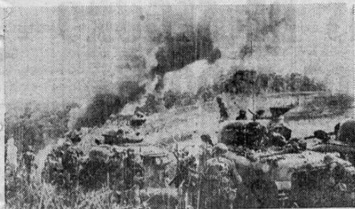
Patrullas del ejército estadounidense, apoyadas por tanques ligeros, operan en la selva de los alrededores de Holanda, Nueva Guinea Holandesa, donde persiguen a las tropas japonesas que se vieron obligadas a huir después de la invasión de sorpresa llevada a cabo por las fuerzas del General Douglas MacArthur, en un avance de seiscientos cincuenta y cuatro kilómetros.

En su ayuda al comercio, ruégole no olvidar la Cafetería "LA MAGNOLIA" — 60 varas Norte del Correo. — Abierta toda la noche. — VISITENOS.